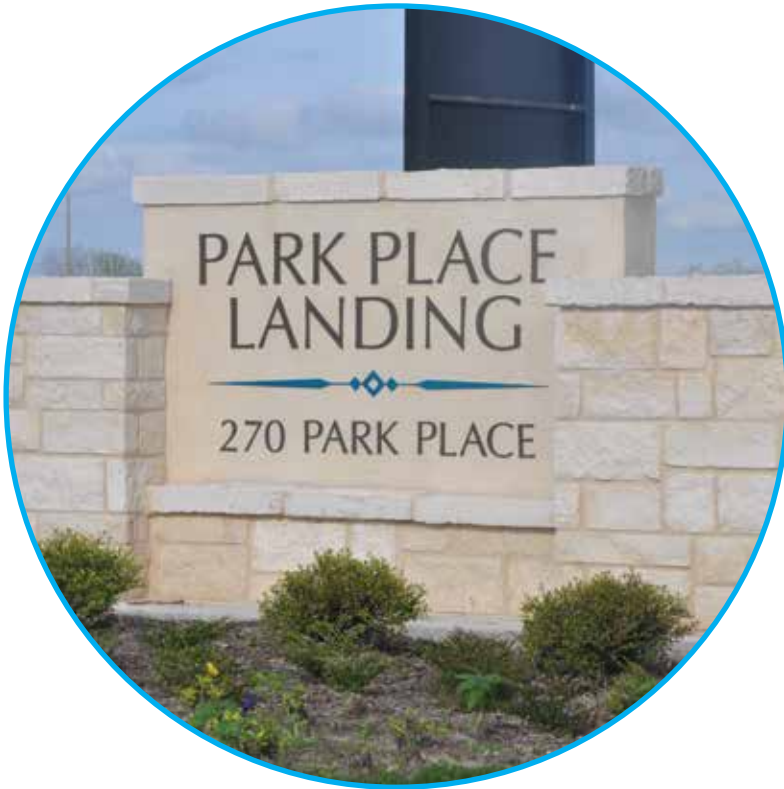
Park Place Landing 270 Park Place Kenedy, TX 78119